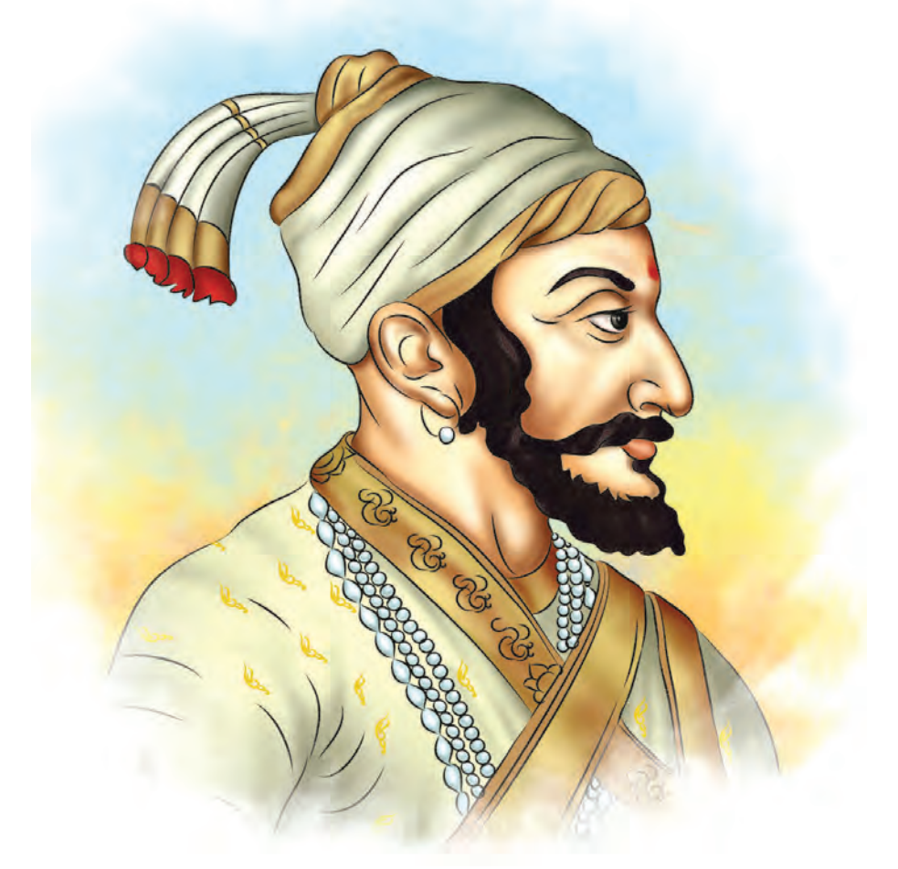
Chhatrapati Shivaji Maharaj

Maharaj ascended the throne of Swaraj . He now became the Chhatrapati of the Swaraj . As a symbol of sovereignty, the Rajyabhisheka shaka (the coronation era) was started. Maharaj became the founder of a new era. On the occasion of the coronation, special coins were minted – a gold coin called Hon and a copper coin called Shivrai with the legend 'Shri Raja Shivachhatrapati' inscribed on them. Thereafter, all royal correspondence